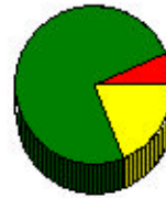
Education - Current Enrollment