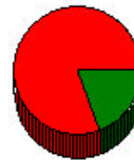
Relationship of Occupant