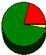
Home Heating Source