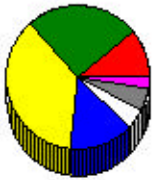
Education - Highest Level Attained