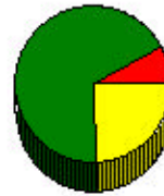
Education - Current Enrollment