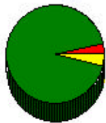
Home Heating Source