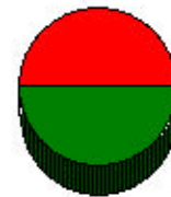
Relationship of Occupant