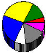
Education - Highest Level Attained