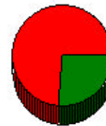
Relationship of Occupant