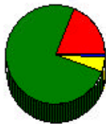
Home Heating Source