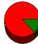
Relationship of Occupant