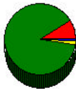
Home Heating Source