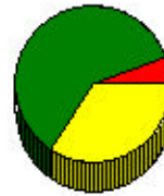
Education - Current Enrollment