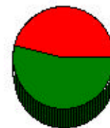
Relationship of Occupant