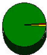
Home Heating Source